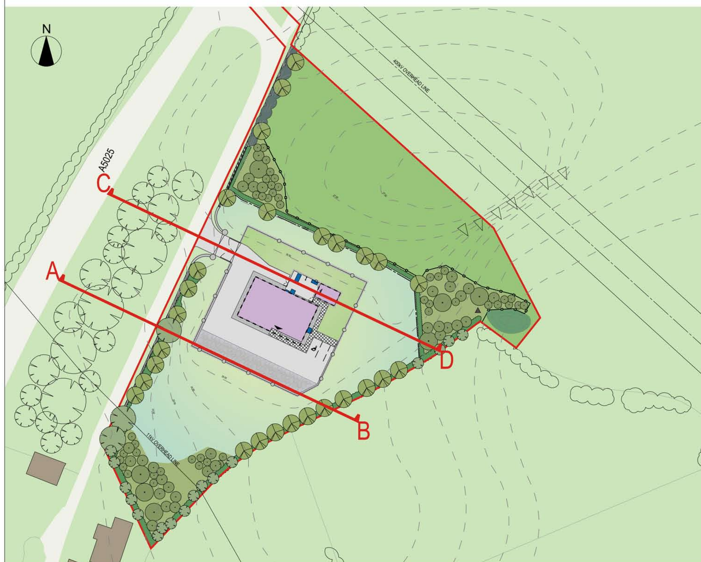
Section elevation location plan 1:500 @ A0

1. This drawing is part of the set of planning drawings listed below in the table and is to be read in conjunction with these drawings and all other documentation associated with the Horizon planning submission for the alternative premises for the Magnox AECC and DSL.